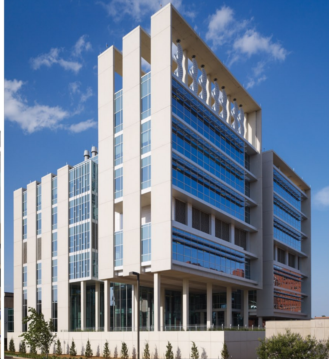
Oklahoma Medical Research Foundation - New Research Tower / S-LAB AWARD WINNER