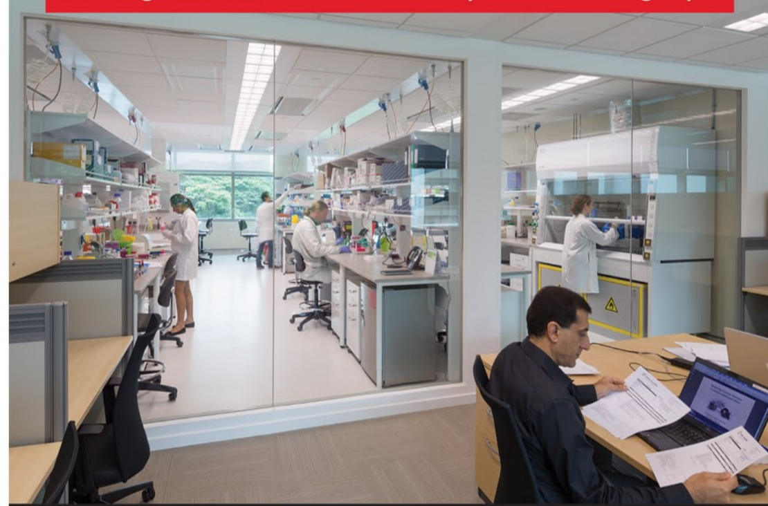
Campus for Research Excellence and Technological Enterprise (CREATE) / LABORATORY OF THE YEAR

An interactive, all-day session to share campus and building-wide ideas for academic and private research groups